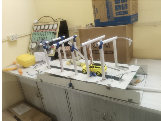
Fig. 8.1: Implemented Hardware Prototype of Eco-friendly Automatic Car Washing Robot