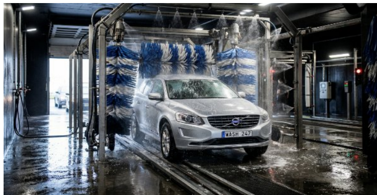
Fig. 3.1: Automated Car Washing System Showing Spraying and Brushing Stages

All operations are controlled by the microcontroller using predefined programming logic. The system ensures proper sequencing and timing of each stage using relay-based switching. This fixed control mechanism enables reliable and repeatable operation without the need for complex sensing systems.