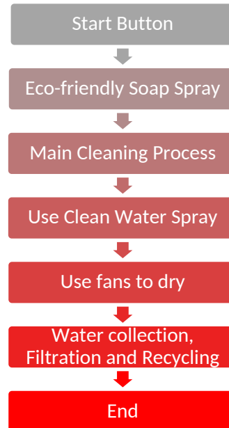
Fig. 4.2: Flowchart of Automatic Car Washing Process